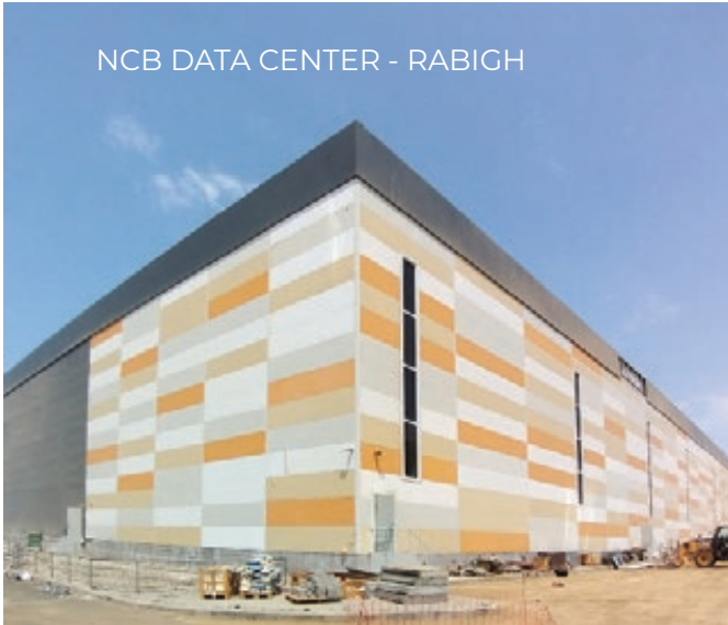
NCB DATA CENTER - RABIGH