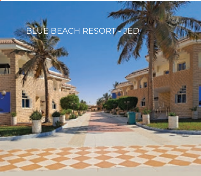
BLUE BEACH RESORT - JED