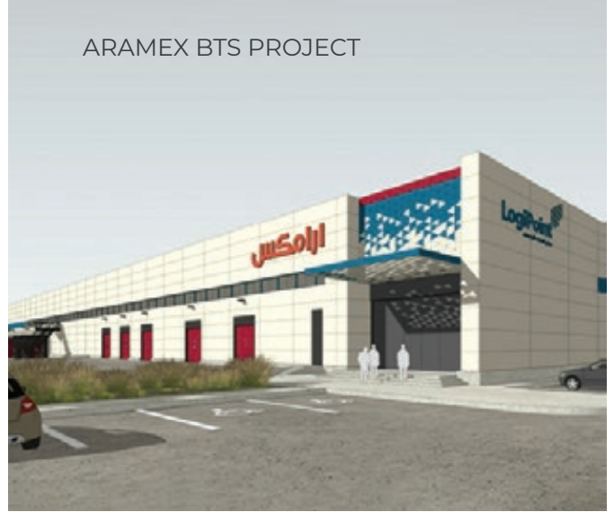
ARAMEX BTS PROJECT