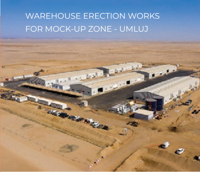
WAREHOUSE ERECTION WORKS FOR MOCK-UP ZONE - UMLUJ