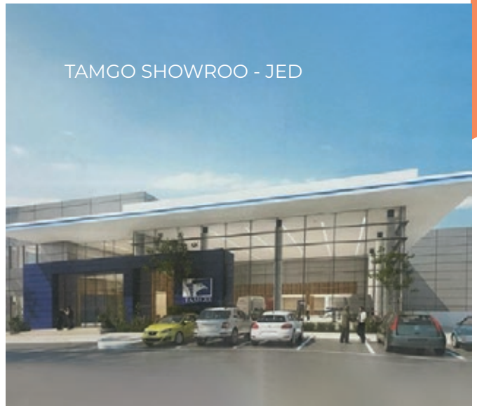
TAMGO SHOWROO - JED